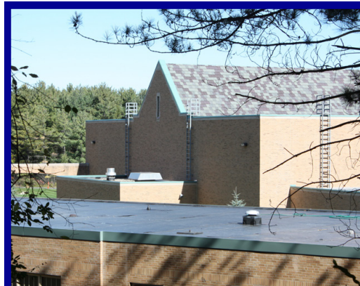
The proposed project would include partial roof replacement.