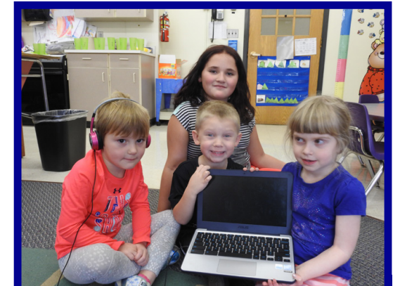
Three STEM classrooms will be added, one in the High School, one in the Middle School and one in the Elementary.