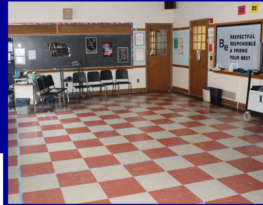
Renovations will be made to the chorus room as part of this proposed project