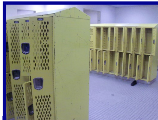
The boys and girls locker rooms will be renovated with new flooring, plumbing and locker replacement.