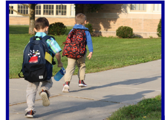
Aging and cracking asphalt and sidewalks will be restored ensuring the safety of our students.