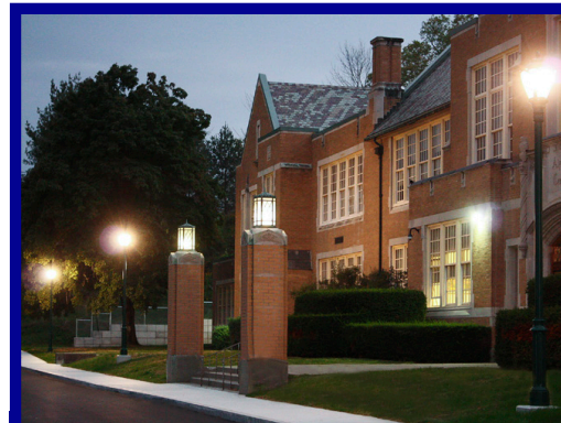
Lights would be converted to LED technology with automated electronic controls to save energy.