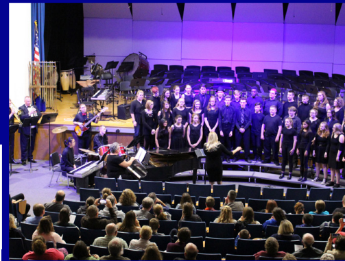
The auditorium will be renovated with new doors, seating, flooring, HVAC and the lobby will be restored