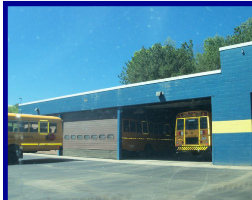
The bus garage will be restored as well as receive drainage upgrades, HVAC and fire alarm upgrades and overhead door replacement.